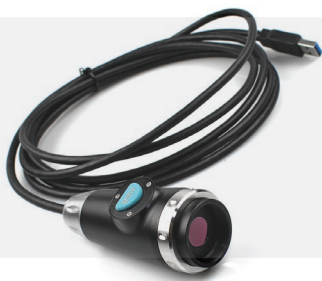
Portable High Resolution Camera Full HD | 1080P | 2.8MP