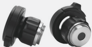
Ultra HD IPX7 Waterproof C Mount | Optical Head Adapter